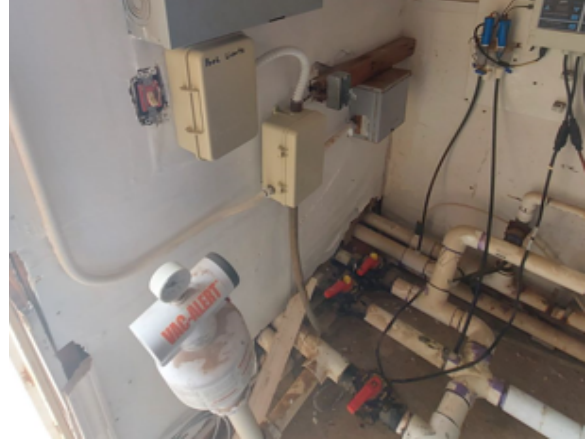
Timers and electrical boxes were replaced.