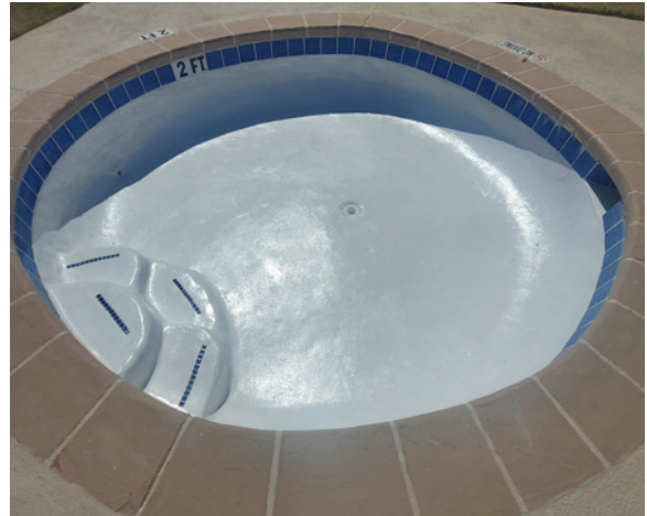
Pool repainted and cleaned.