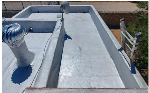
Roof resealed and turbine installed.