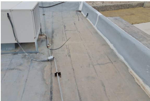
Previous roof repairs done with incorrect materials.