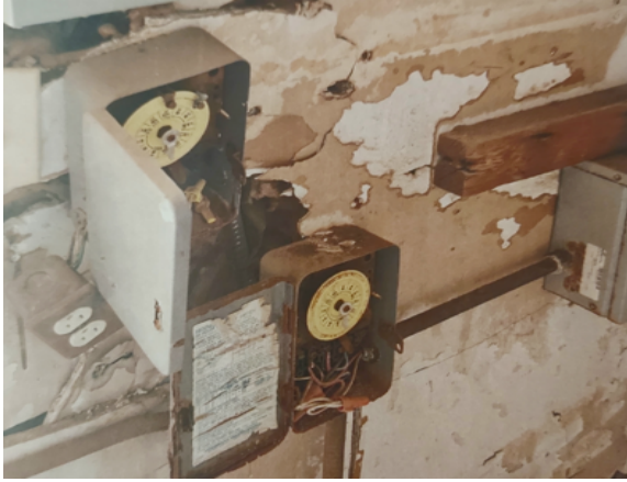
Electrical area Pump Room